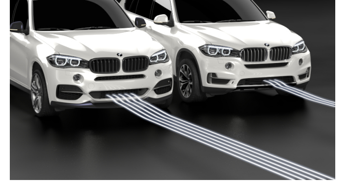
Power boost with the M Performance Power Kit (more cool air passes through the larger charge air cooler)