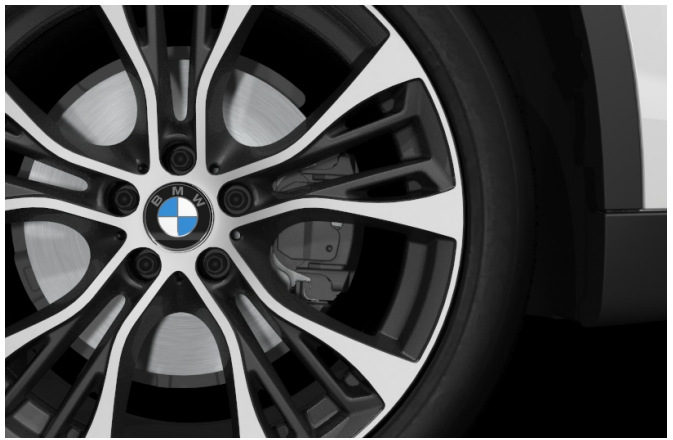
18" brake disk on the front axle